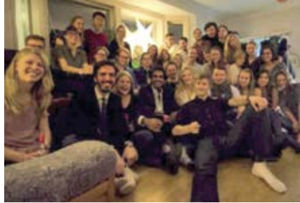
Post-exam class dinner

with. All the exchange students I lived with, the other exchange students on my course, and all our Swedish classmates. I don't know if that's due to us all having the same open and friendly personality as exchange students, or just the integrating nature of Stockholm. Either way, I've enjoyed every minute.