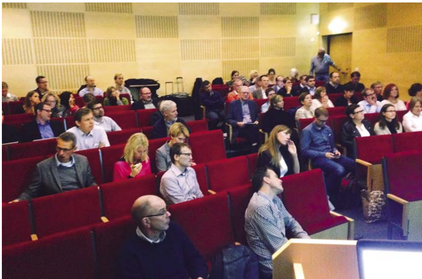
SPCG Trial meeting October 2014.