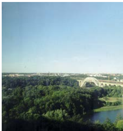
View from my room.

to a slightly larger party. As long as limits are respected (and complaints avoided), it's a rare to find an unsatisfied resident.