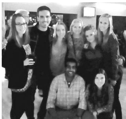
The eight exchange students.

The focus is more on the clinical, practical aspects, achieved by working in a safe, controlled environment. Its ideal, everything is interactive. Situations which promotes developing the relevant skills and cements understanding. Students learn from each other, and from their supervisors, ensuring reciprocal benefit.