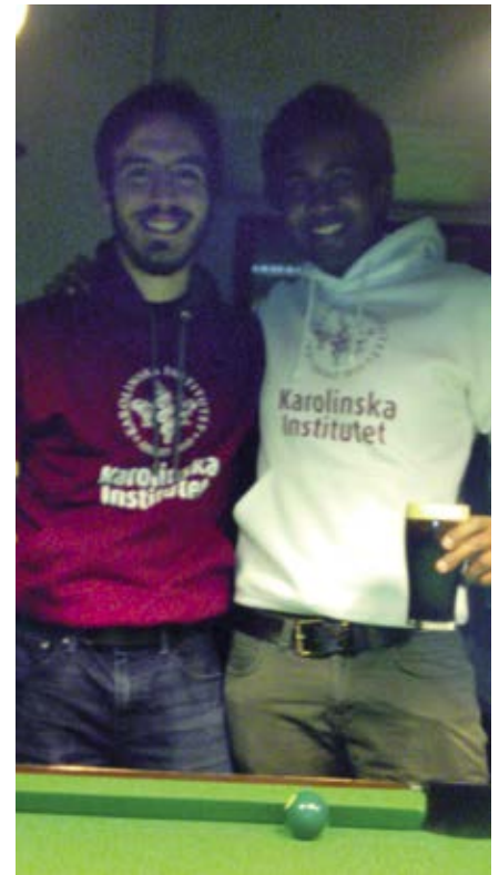
Matching geeks.

And here I am, one semester later, having just finished the course. Only positive memories. The place. The people. The course. Everything. Just an incredible experience :) ■