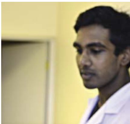
Previously.

So what were my options? A list of schools around Europe. The one that stood out, KI, world famous, home of the Nobel Prize. Who wouldn't want to come here? I applied, and to KI only. My coordinator said to choose some others, just in case. I refused, it was KI or nothing. Same dilemma when it came to courses, I had my mind set on Surgery.