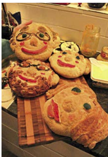
The team in charge.

I could go as so far to say that this is my perfect training ground. Top quality facilities, the best doctors, and a supportive student community. Where competition and personal success is second to a collaborative performance. Where everyone is talented, and there is no lack of motivation as the passion for medicine still burns. Okay, fine, I admit it; I'm a geek and get excited by this.