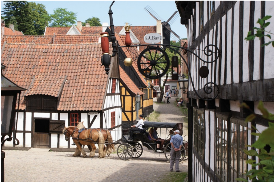
"The Old Town" Open-Air museum.